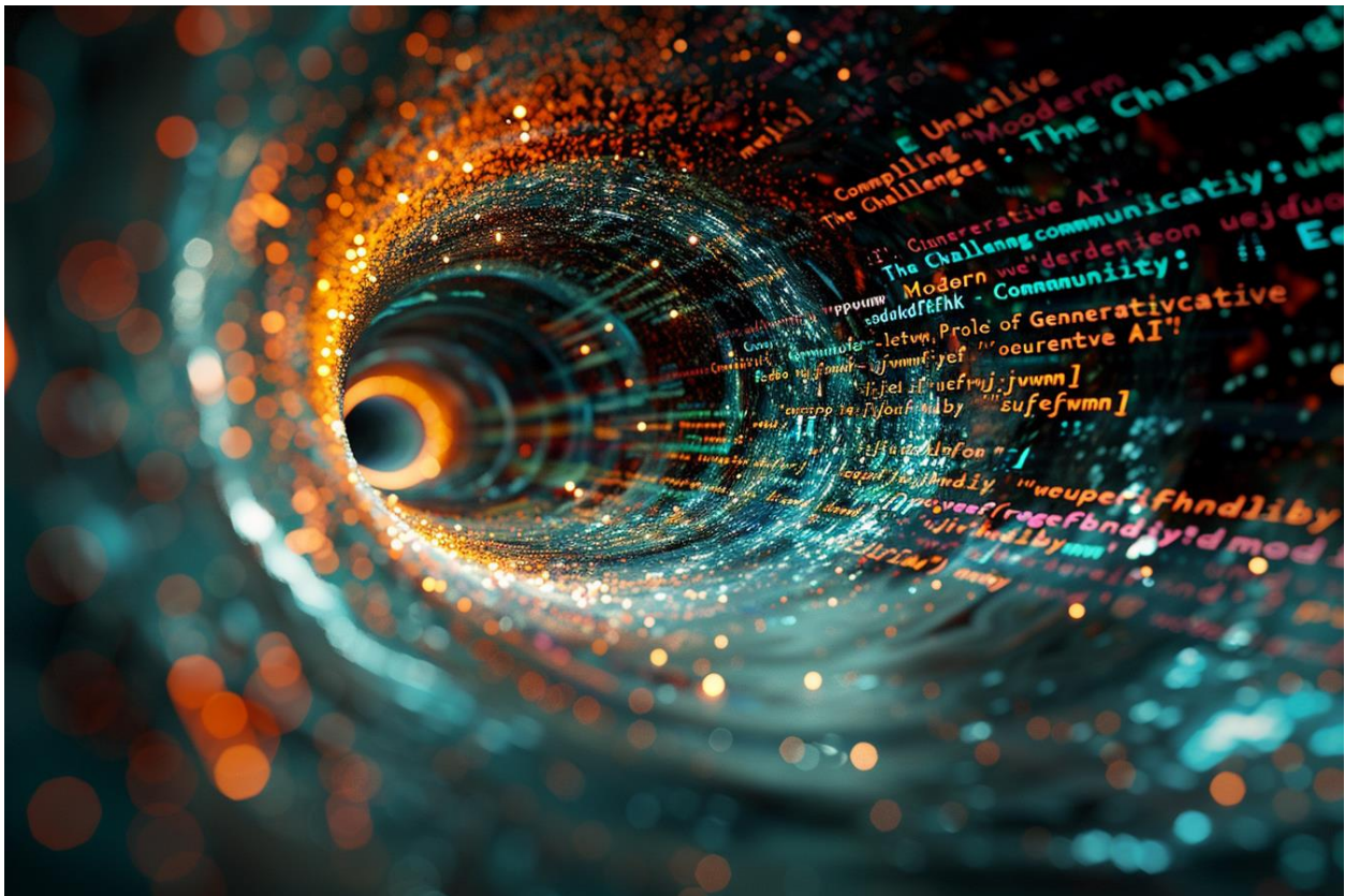
Gen-AI by Dr. Nikravesh

The "Gen-AI Transformation Oracle Series" is a comprehensive collection of six books (with specialized GPTs) that explore the profound impact of Generative AI (Gen-AI) across various domains. These books provide a detailed analysis of how Gen-AI is transforming personalized content creation and delivery, as well as forecasting future trends. The series covers diverse areas, including news, entertainment and media, personalized content creation, personalization, content delivery, social media, job markets, business creativity and innovation, socio-economic impacts, mental health, ethical issues, and future trends. It offers strategic insights for leveraging AI-driven technologies to enhance efficiency and engagement.